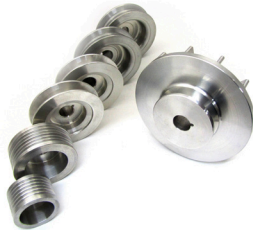
Pulleys and Fans