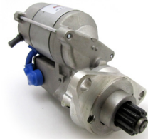
High-Torque Starter Motors